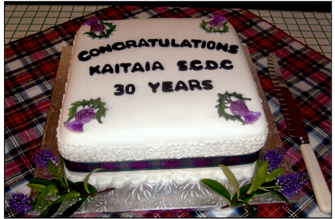
Our beautiful cake

This class is progressing well and growing. These dancers, ranging from 7-13 years, along with Mums and a Nana, joined us for our 30 th Anniversary dance.