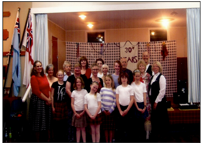
A special occasion in Kaitaia

If interested please contact Rob Longley at kath.rob.longley@gmail.com or ph 021 185 4056