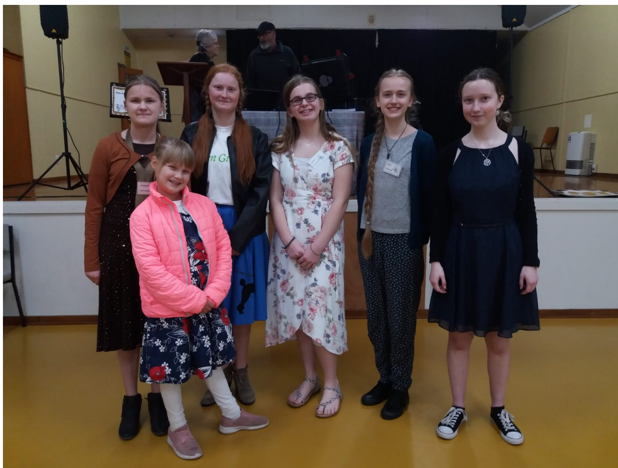
Tokoroa JAMS at the Tokoroa Annual Ball 2021

Where to begin, the Tokoroa annual ball was a blast as always. But I think I shall start at the beginning. Waking up on that Saturday morning and staring at the ceiling above my bed thinking "today's the day since COVID struck that I could finally see many of my fellow dancers in person again". I pulled on some old clothes and began preparations.