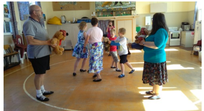
Making up numbers in the children's class.... yes, it is your illustrious President, dancing with his teddy bear!!