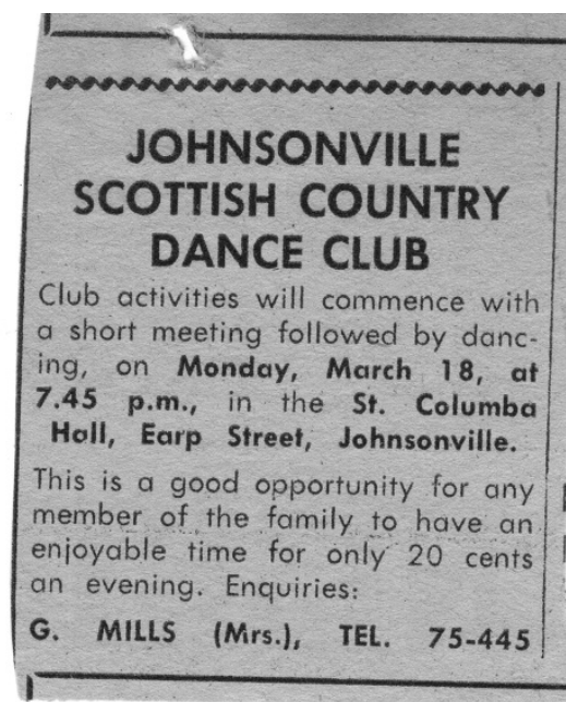
A glimpse into the past... 1968 (more on last page)