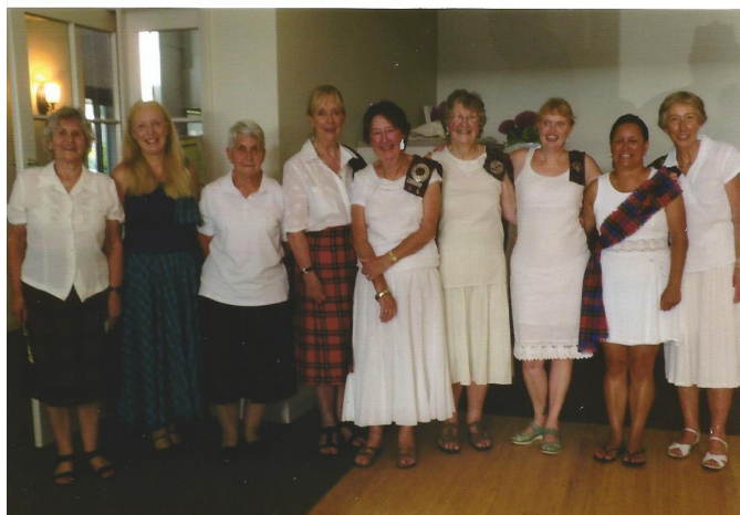
Burns Night dancers

Thames has a weekly Saturday Market, so it is intended to "dance on the green" in the market area (Pollen Street north/Pahau Street) which could attract a few more members, or at least give folk an idea of what Scottish Country Dancing is all about.